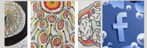
General course contents

The general tier gives you lifetime access to the recorded lectures, workshops, animated videos, bonus content and personal work and reflection papers in the sections described above (from trauma to truth/creation). You can also join the open access Facebook group from the original course, and share your reflections with an active community.